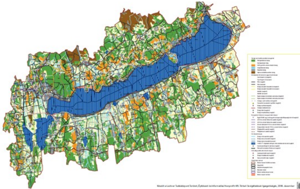
Detail 3: CSDP – Structure plan of the Balaton Area (map designed by Lechner Tudásközpont <Lechner Competence Center>)